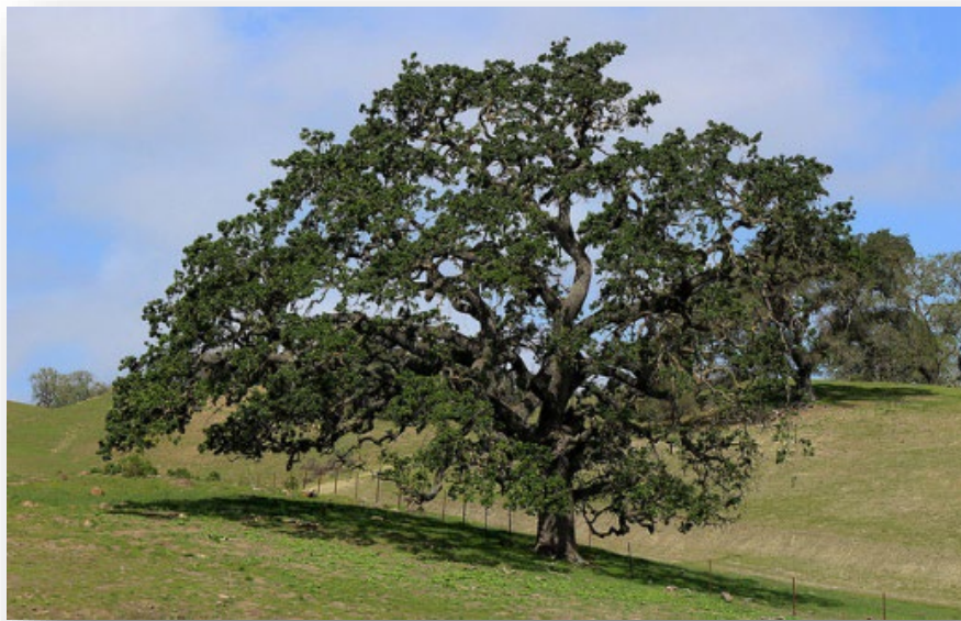
Valley Oak Youth Academy – The Valley Oak tree is native to the Sacramento area. It symbolizes lasting strength and endurance. The acorn of the tree symbolizes unlimited potential that something so small has the potential to grow into a large majestic oak tree. A tree mural is painted in the program-housing unit.

During initial orientation, a tree-focused activity identifies all the supports youth have when they enter the program. This visual tree continues to “branch” out with additional supports (e.g. family, advocates, providers, teachers, etc.) as they progress through the program. When youth leave the program, the visual reminds them they are not alone, they have support from many areas of their life, and they are growing into strong individuals capable of making healthy positive decisions that benefit themselves and the community.