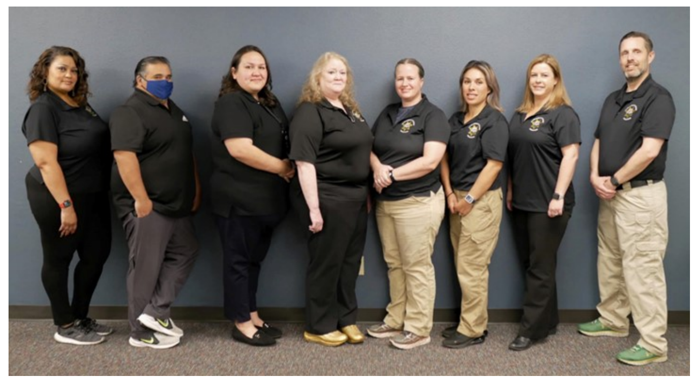
Victim and Restitution Services unit officers and staff L to R:

Probation's Victim and Restitution Services unit works closely with the Sacramento County District Attorney's Office and victim support organizations to help adult and juvenile victims with the emotional distress and financial losses that can occur as a result of being the victim of a crime.