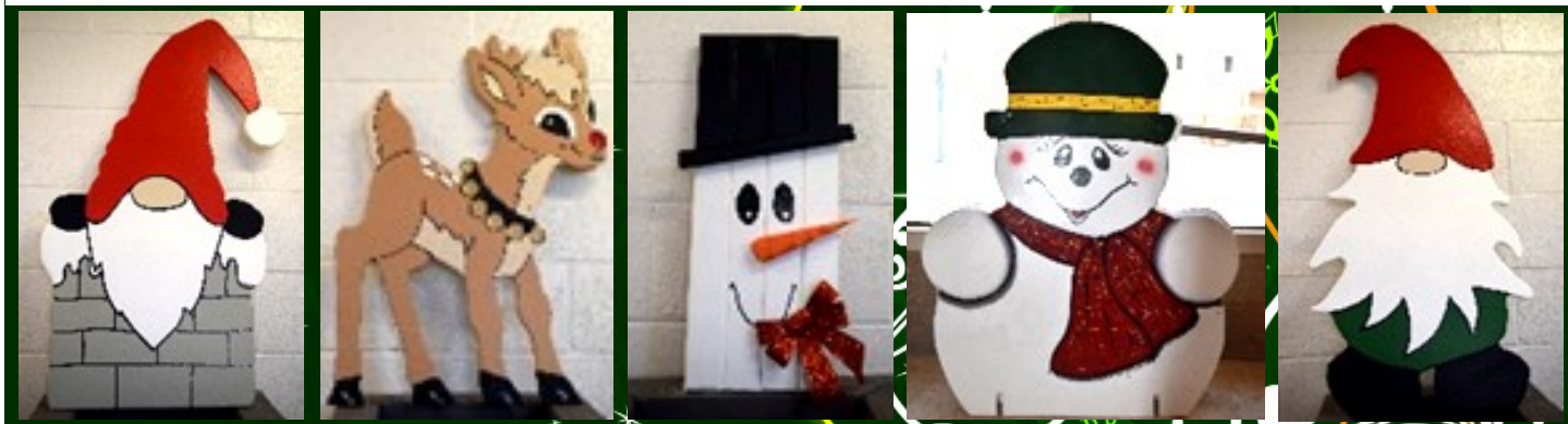
Youth Made Holiday Ornament Gifts for their Families