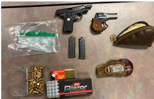
February 16, 2021 2400 Block of Santina Way

Possession of a Firearm, Possession of Ammunition by a Prohibited Person, and Possession of a Controlled Substance.