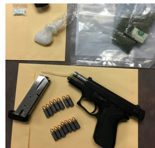
February 19, 2021 3300 Block of Virgo Street

Officers assigned to the Age of Majority (AOM) unit contacted the two occupants of the vehicle and determined they were on Juvenile Searchable Probation. A search of the vehicle revealed a stolen loaded handgun, Oxycodone pills, marijuana, and methamphetamine. All three subjects were arrested and booked into the Sacramento County Main Jail. One subject is pending a Violation of Probation. Another subject is pending charges for Felon in Possession of a Firearm, Possession of Narcotics, and Possession of Controlled Substance. The third subject is pending charges for Carrying a Loaded Firearm on One's Person and Possession of Controlled Substance.