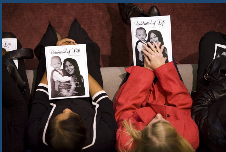
South Sacramento Barbershop Shooting – December 2010

* CDC Injury Prevention & Control: Violence Prevention **Kaiser Permanente (2010)